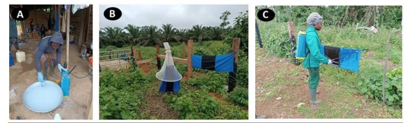
Figure 2 - Preparation, installation and replenishment of screens and traps. A) dilution of insecticides to soak screens; B) installation of screens 100 cm from traps; and C) spraying of screens after two days post-installation.

The screens were set atleast 1 m from the vavoua traps (Figure 3B). Flies were collected from traps every 24hours with the screens in place for consecutively four days. Additional 15 screens were set in riverine areas and rangeland beside the pen. Since the study was conducted during the rainy season that was characterised by heavy rains, they were sprayed (Figure 3C) after two days post-installation.