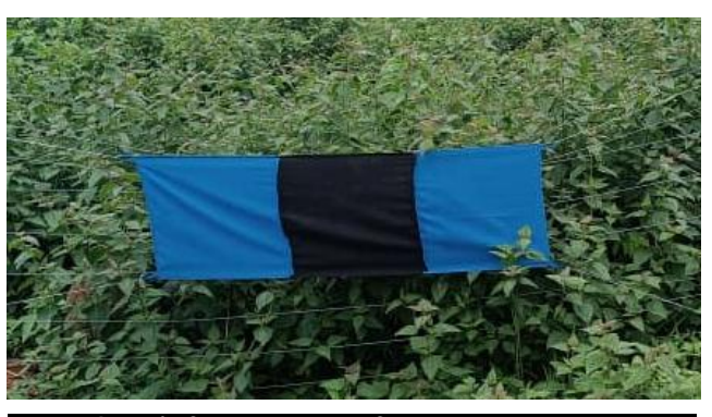
Figure 2 - A 150 cm length × 50 cm width screen.

The insecticide used for the treatment of screens was deltamethrin (DECTROL EC 50; MEDIVET). In the field, the insecticide solution was prepared by diluting 5ml of