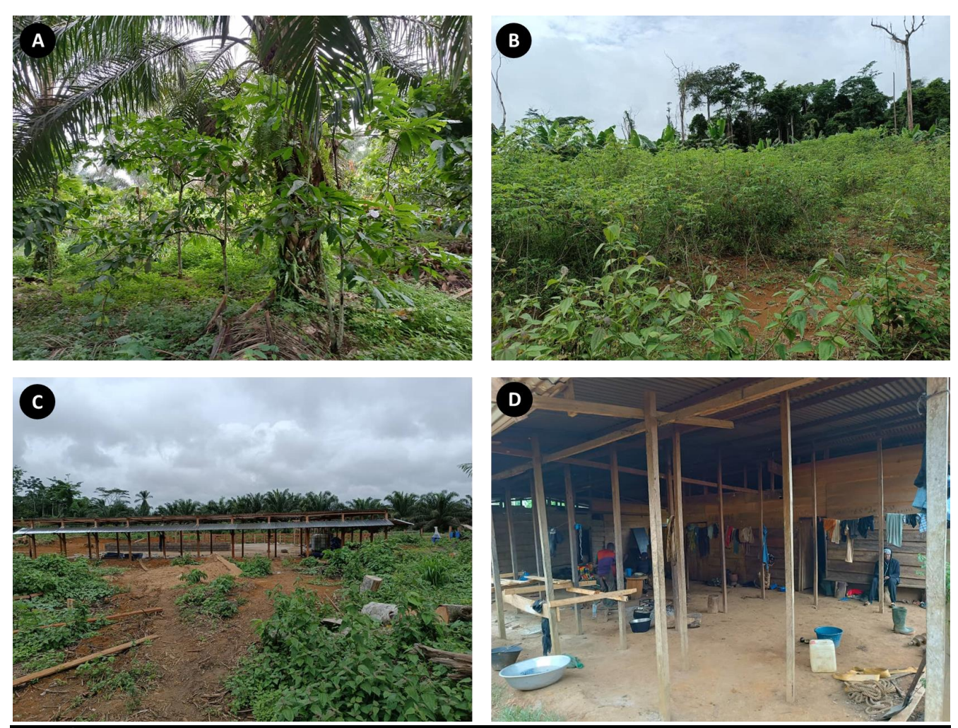
Figure 1 - Images of study site. Palm tree and cocoa mix farm (A); cassava farm (B); feedlot under construction (C) and house of workers (D).

An entomological survey in the rainy season from 19 to 26 of May 2022 was conducted in Ndogbea village found in the Nyong and Kelle division of the Center region. This village falls within latitude 03.74231 north and longitude 011.23158 east. It is a fast growing village with several ongoing agricultural projects such as cocoa (Figure 1 A), palm oil (Figure 1 A) and cassava plantations (Figure 1 B) as well as livestock projects such as aquaculture and cattle rearing. The study site was a 1 hectare feedlot under construction (Figure 1C), located beside >40 hectares of palm oil and cocoa plantation. This agricultural and livestock site had about 20 workers staying in wooden houses beside the farm (Figure 1D). The vegetation of this site is entirely forest as this area falls within the mosaic-forest agro-ecological zone of Cameroon. A river network, palm trees and forest canopies provide favourable breeding grounds for fly-vectors. During the study month, the average climatic variables were: mean temperature of 30^{\circ} C, precipitation of 39.3mm, humidity of 85%, and wind speed of 4 km/hr. The four sides of the feedlot yard were ecologically heterogenous and traps were set facing the different sides. The characteristics of the different trap-sites are described in table 1.