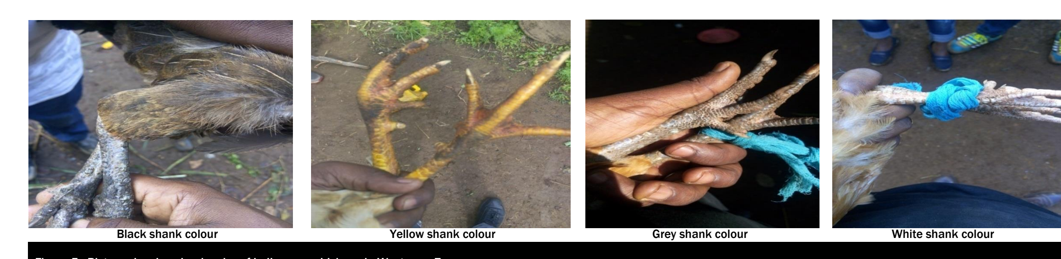
Figure 5 - Picture showing shank color of indigenous chickens in West-omo Zone.

Figure 4 - Pictures showing comb structure and head type of indigenous chickens in West-Omo