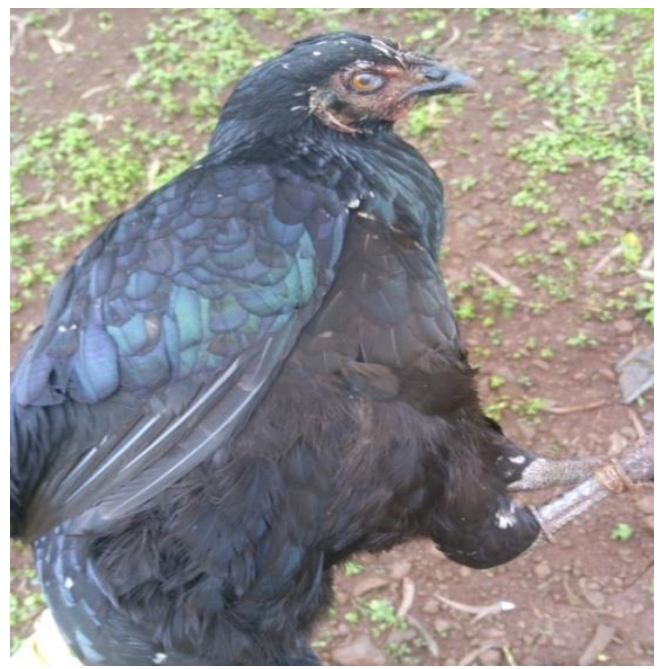
Black plumage with black shank colour

Earlobe color had a significant (P<0.01) relationship across all the study agro-ecologies (Figures 2-4). Five types of earlobe colors (red, white, yellow, grey, and dark brown were identified among the indigenous chickens with 42.1%, 32.7%, 21.7%, 2.3%, and 1.2%, respectively) were identified among the indigenous chicken in the study area. Male ear lobe color was yellow (50%) in the lowland, whereas red was more common in the highland and mid-latitude regions, with values of 50% and 50%, respectively. Female ear lobe color was red (as 67%) in the highland, but white (as 48% and 41%) in the mid-altitude and lowland, respectively. The finding of the current study was comparable with reports on Assel chicken (Rajkumar et al., 2017) and indigenous Shaka chicken (Assefa and Melesse, 2018).