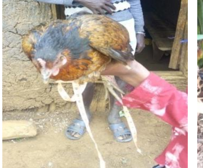
Brown plumage colour