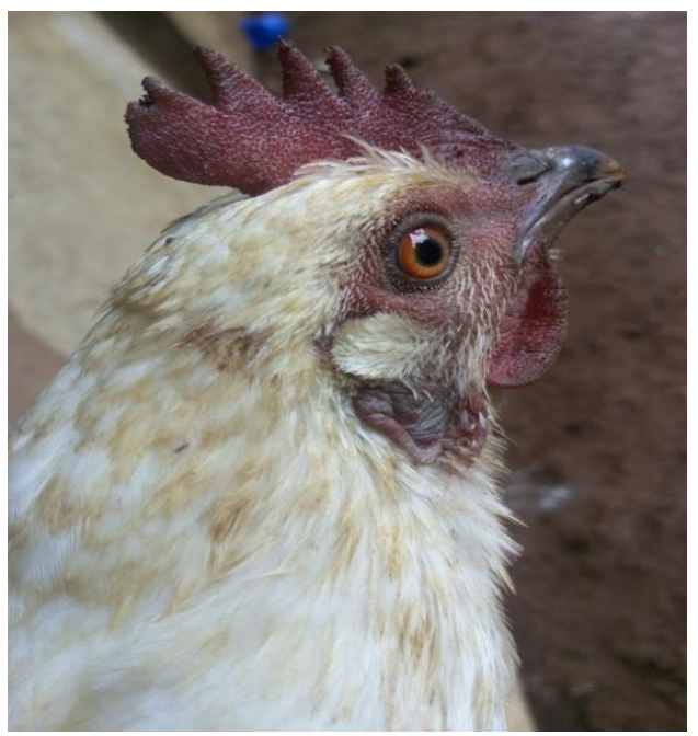
White plumage with orange eye colour