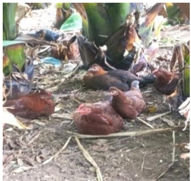
The dominant plumages colour

Figure 2 - Pictures showing plumage color of indigenous chickens in West-omo Zone